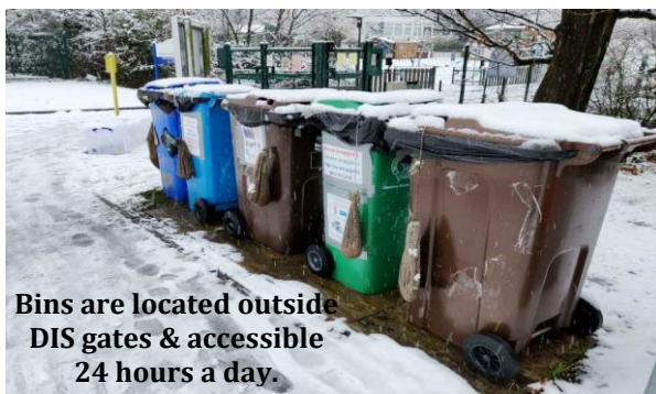
Bins are located outside DIS gates & accessible 24 hours a day.

https://www.terracycle.com/en-GB/about-terracycle