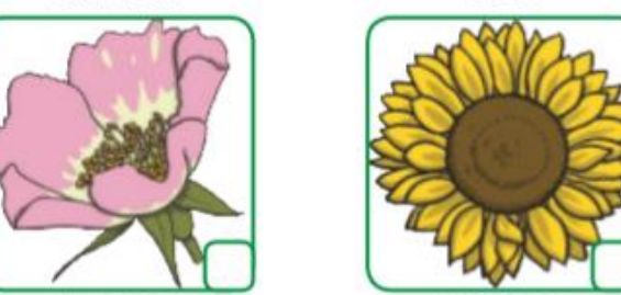
dog rose sunflower