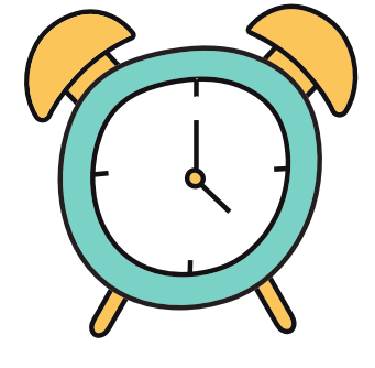
Go to bed at the same time every night