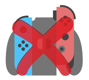
Turn off your game console