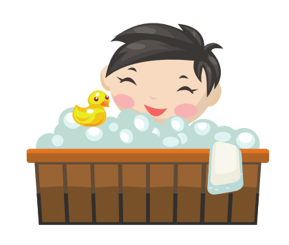
Have a bath before bed