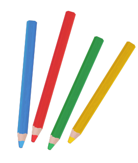
Do some colouring